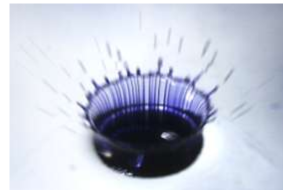
Colored liquid droplet impact on water surface